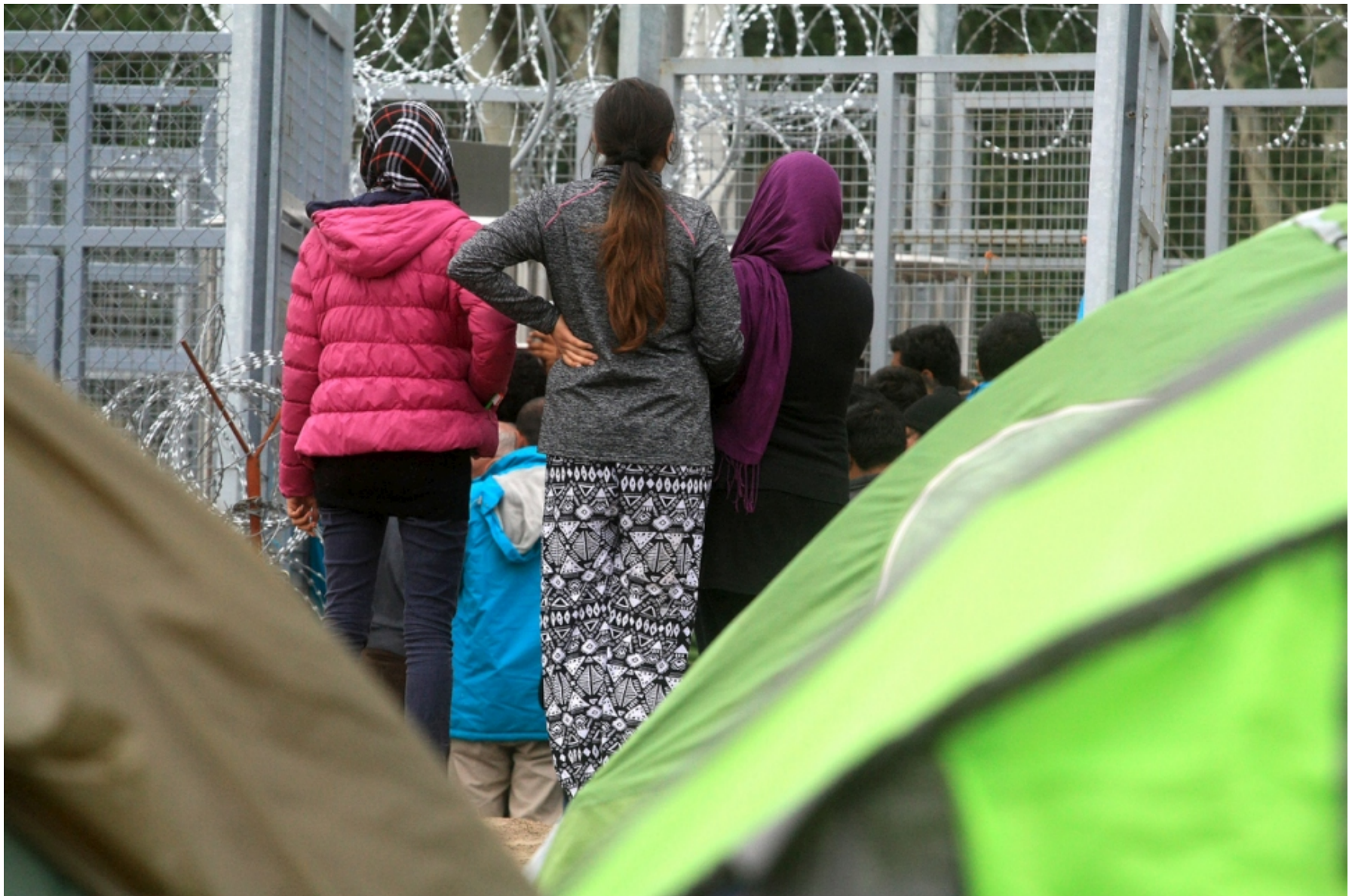
Afghan girls watching as someone is allowed in the transit zone in Röszke.