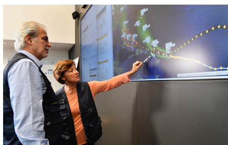
Christos Stylianides at the Emergency Response Coordination Centre