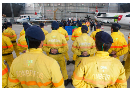
Visit of Commissioner Stylianides to Portugal, 13 February 2017

To set up the new rescEU system and strengthen EU civil protection response to protect citizens, the Commission proposes a significant increase of the EU Civil Protection Mechanism budget, from €577 in 2014-2020 to €1,4 billion in 2021-2027 .