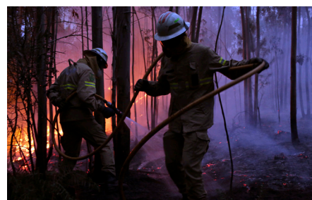
Firefighters from the Portuguese National Republican Guard, Avelar