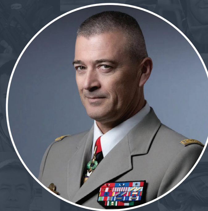
GENERAL THIERRY BURKHARD CHIEF OF THE DEFENSE STAFF